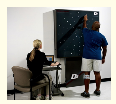
Figure 2: DynaVision 2.0 device.

Also exist the training platform of CogniSense NeuroTracker (http://neurotracker.net) entails an immersive 3-dimensional multiple object tracking program to increase cognitive load. This approach has been studied at various ages, and has been correlated with actual game performance in professional basketball players